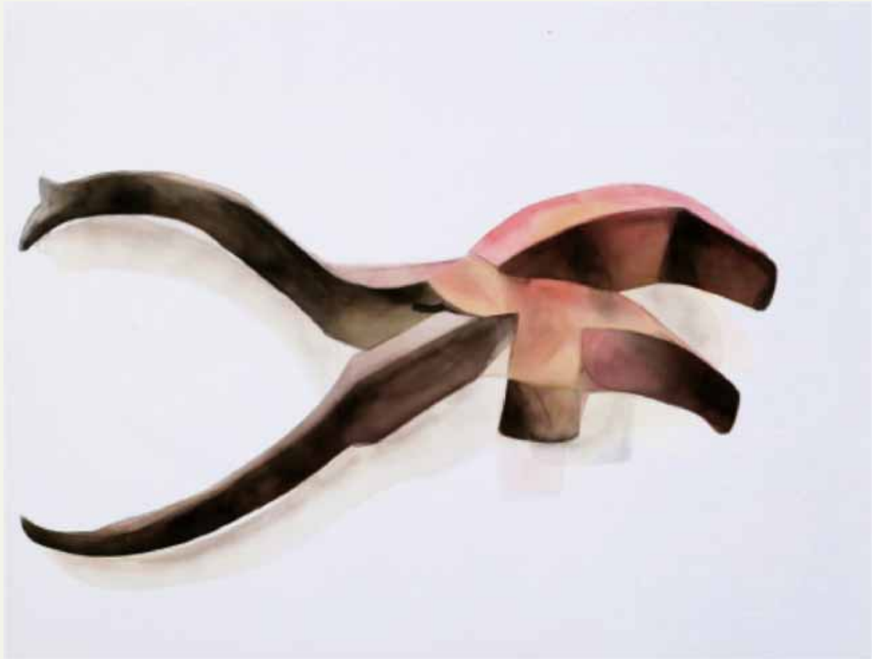
Untitled, 2007, Water colour on acid free paper, 33" x 43"