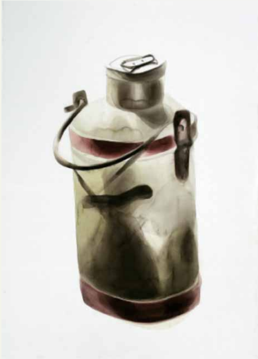
Untitled, 2007, Water colour on acid free paper, 60" x 43"