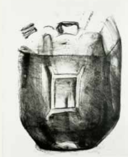
Untitled, 2005, Lithograph, 22.5" x 17", Edition of 4