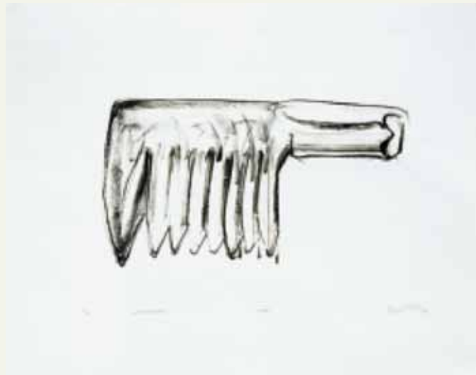
Comb, 2005, Lithograph, 14.5" x 21", Edition of 6