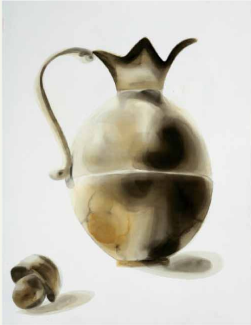
Untitled, 2007, Water colour on acid free paper, 43" x 33"