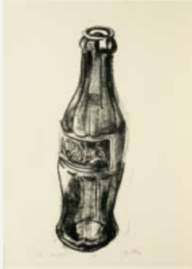
Coke, 2005, Lithograph, 23.5" x 15", Edition of 4