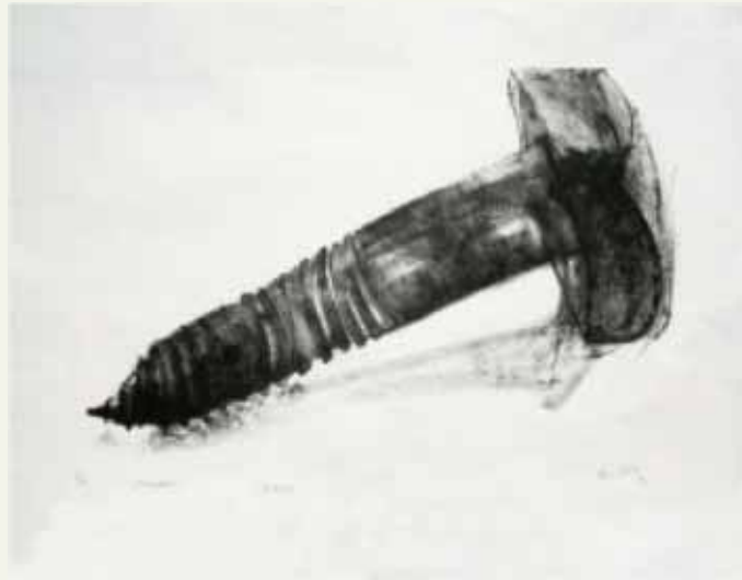
Screw, 2005, Lithograph, 19" x 26.5", Edition of 6