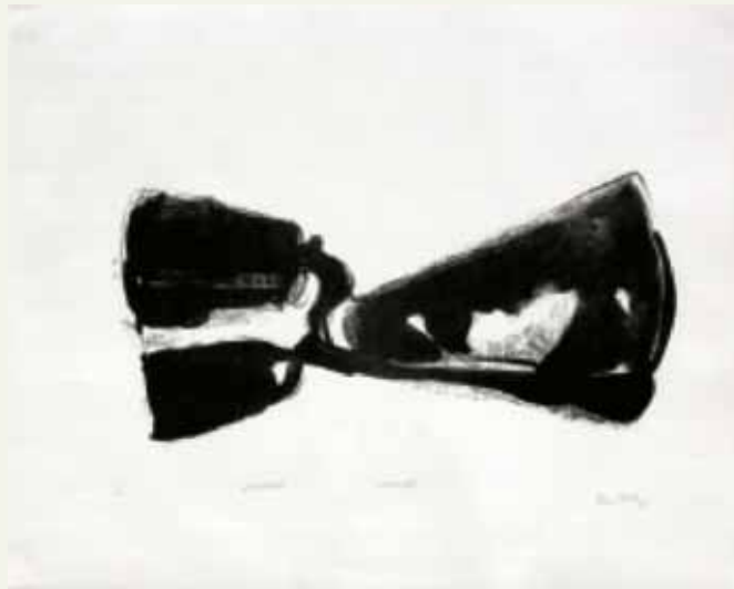
Untitled, 2005, Lithograph, 14.5" x 21", Edition of 6