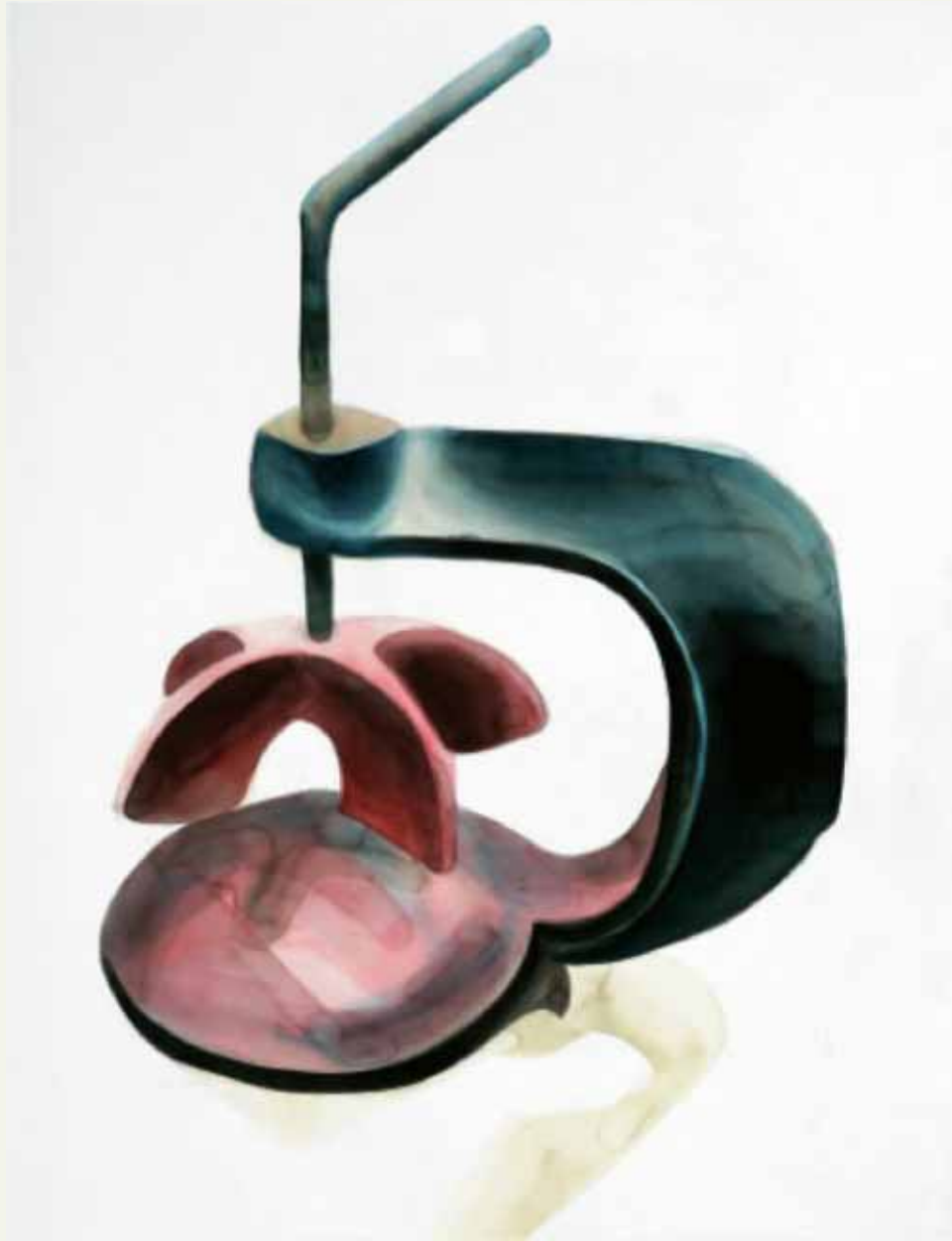
Untitled, 2007, Water colour on acid free paper, 43.5" x 33"