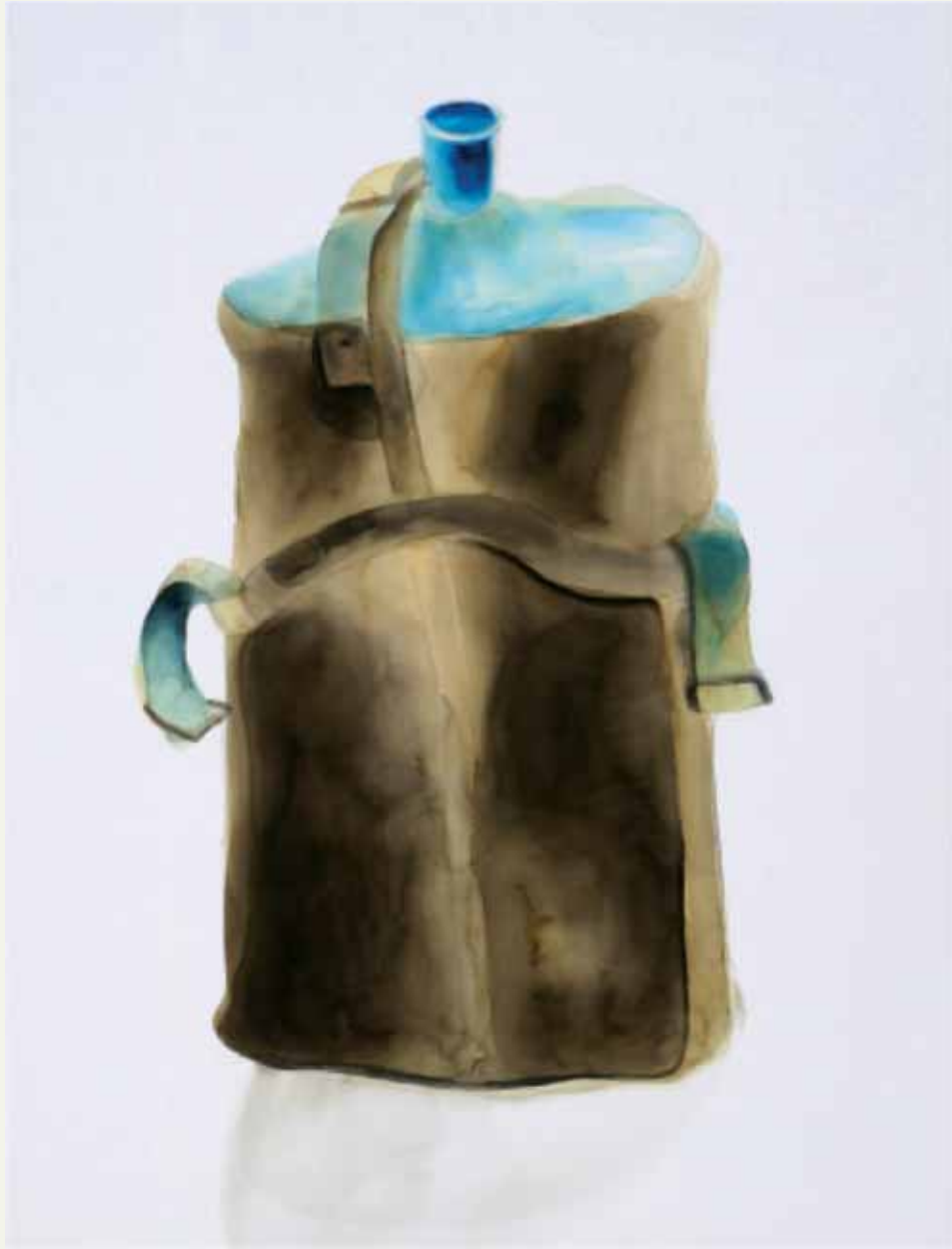
Untitled, 2007, Water colour on acid free paper, 43" x 33"