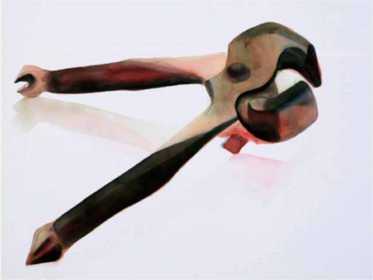
Untitled, 2007, Water colour on acid free paper, 32" x 43"