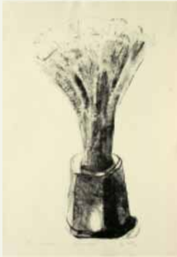
Shaving Brush, 2005, Lithograph, 24.5" x 16", Edition of 6