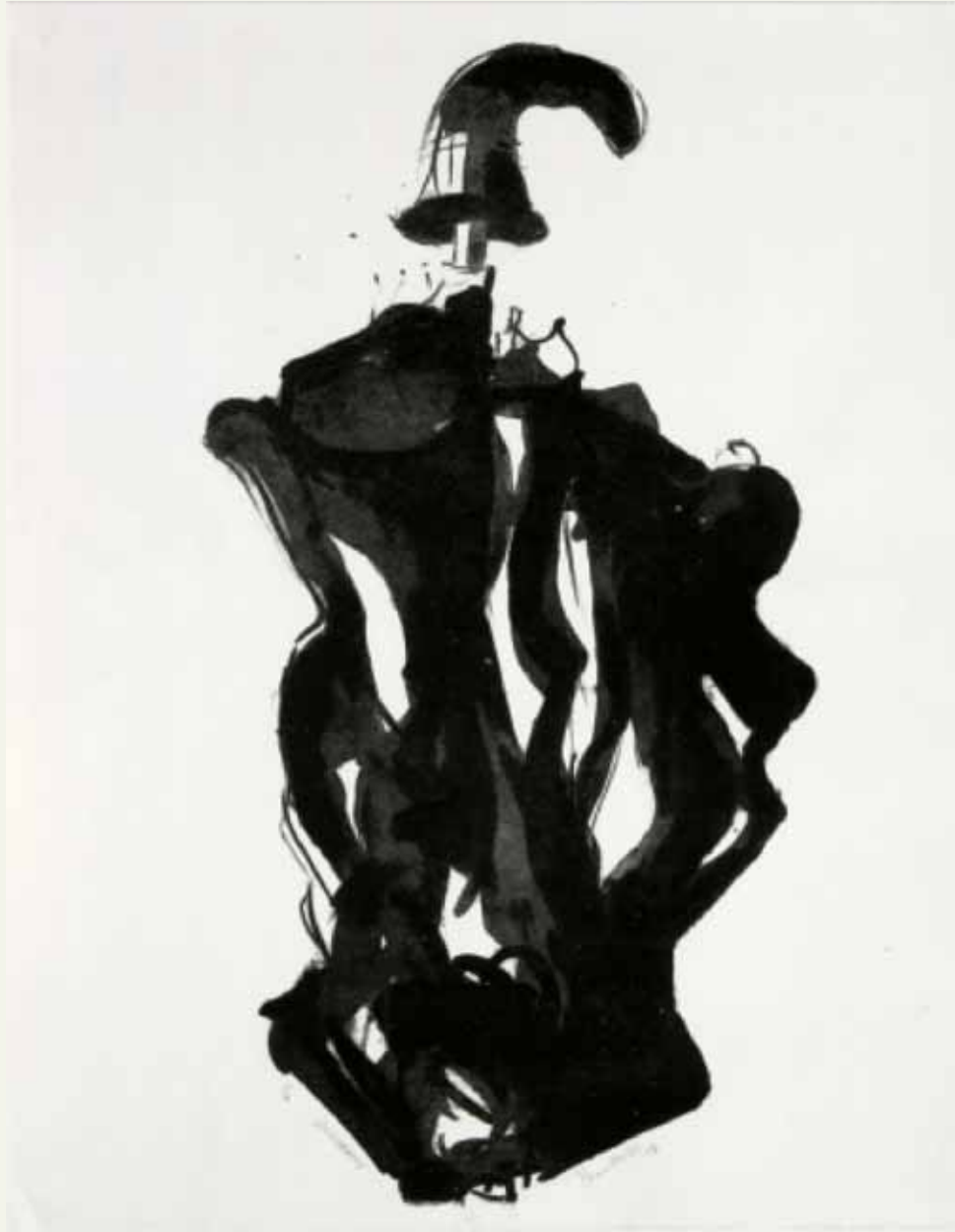
Untitled, 2005, Lithograph, 22.5" x 17", Edition of 6