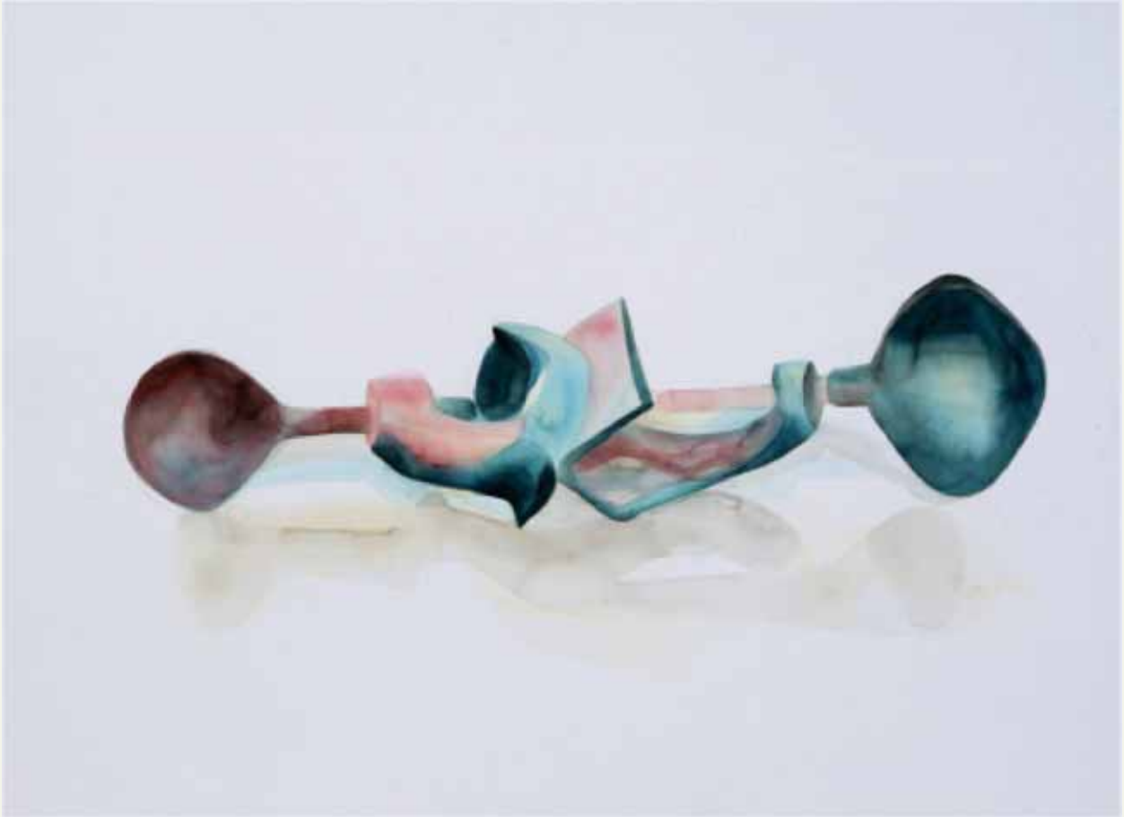
Untitled, 2007, Water colour on acid free paper, 31.75" x 43"