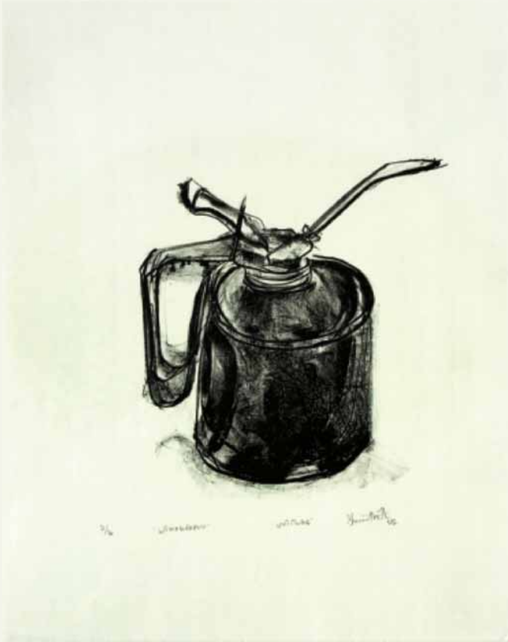
Untitled, 2005, Lithograph, 18" x 16", Edition of 6