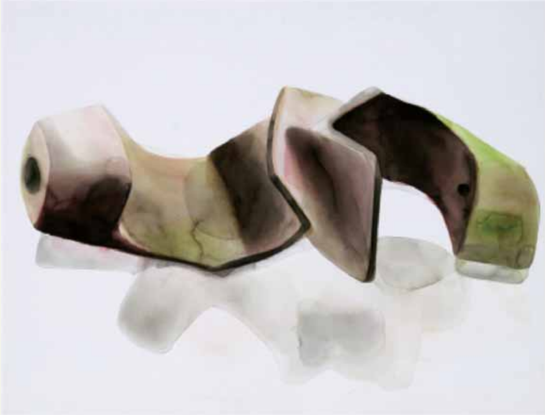
s h a r a t h k u l a g a t t i