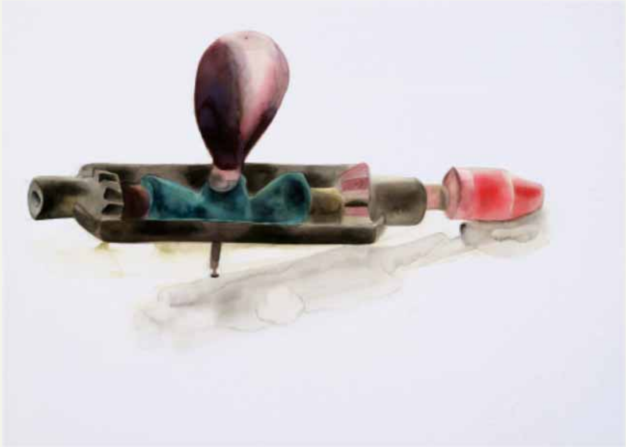
Untitled, 2007, Water colour on acid free paper, 31" x 43"