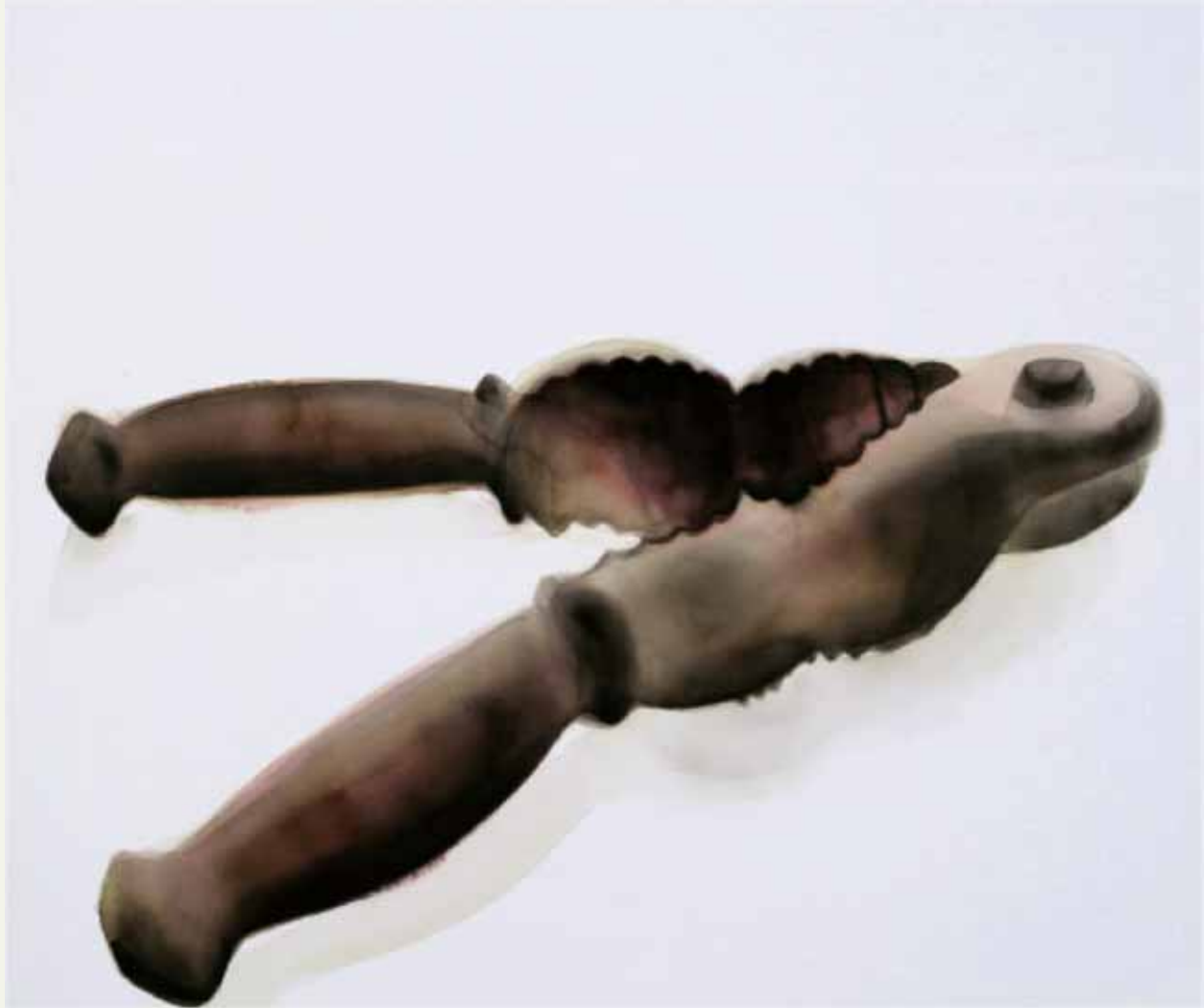
Untitled, 2007, Water colour on acid free paper, 36" x 43"