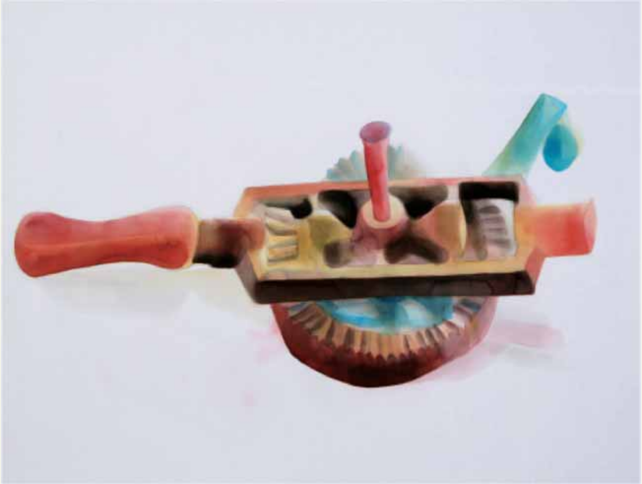
Untitled, 2007, Water colour on acid free paper, 33" x 43"