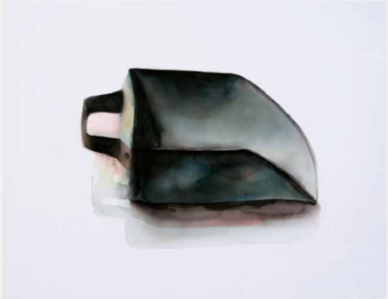
Untitled, 2007, Water colour on acid free paper, 33" x 43"