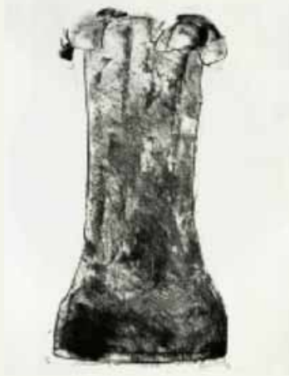
Untitled, 2005, Lithograph, 22.5" x 17", Edition of 6