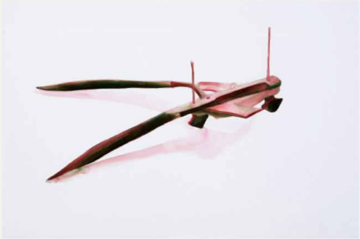
Untitled, 2007, Water colour on acid free paper, 43" x 60"