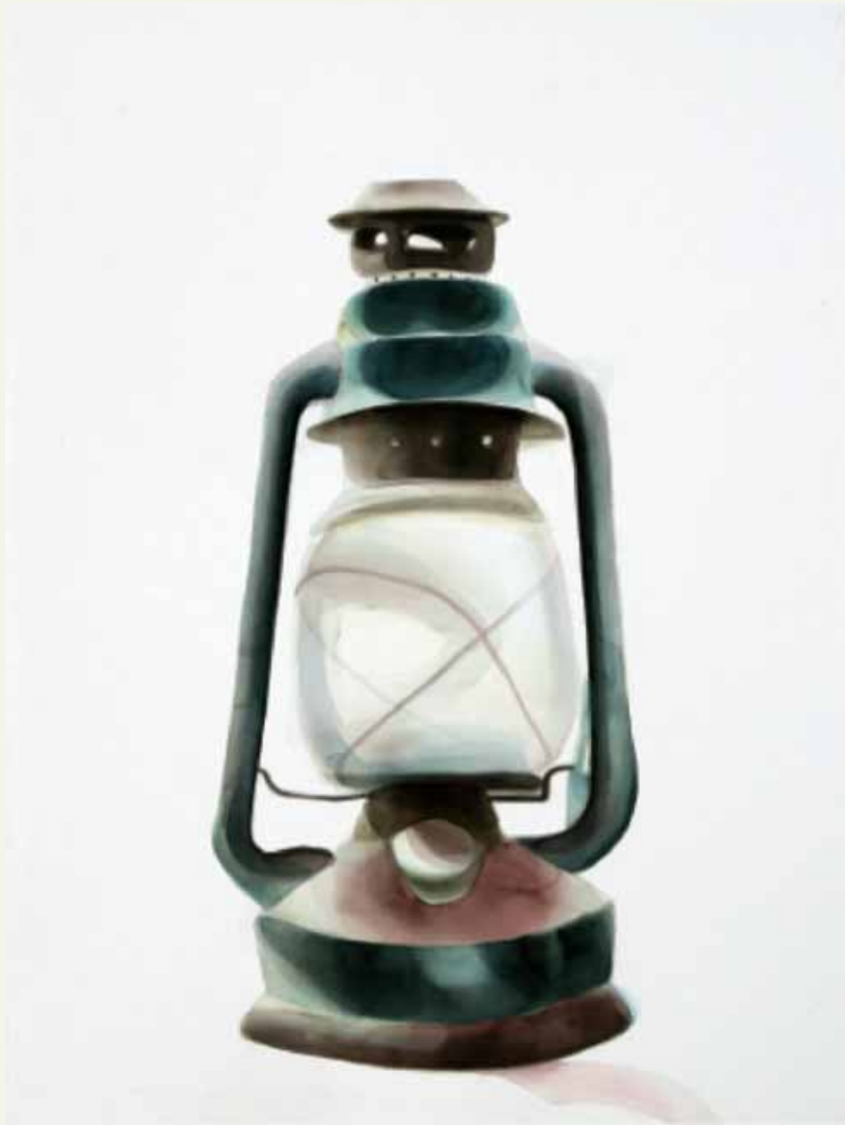
Untitled, 2007, Water colour on acid free paper, 43" x 32"