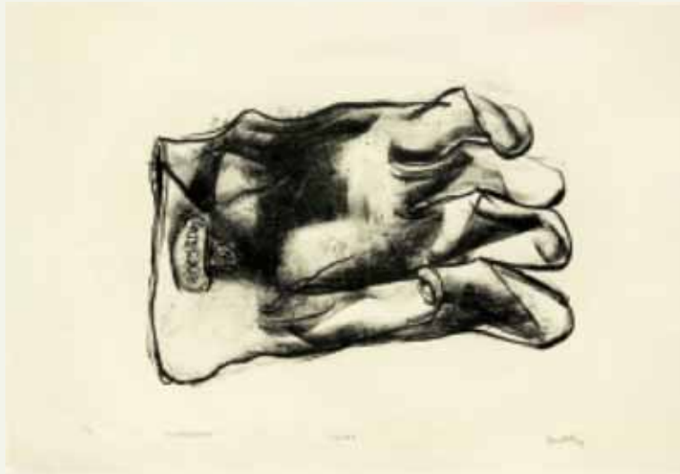
Gloves, 2005, Lithograph, 16" x 23.5", Edition of 6