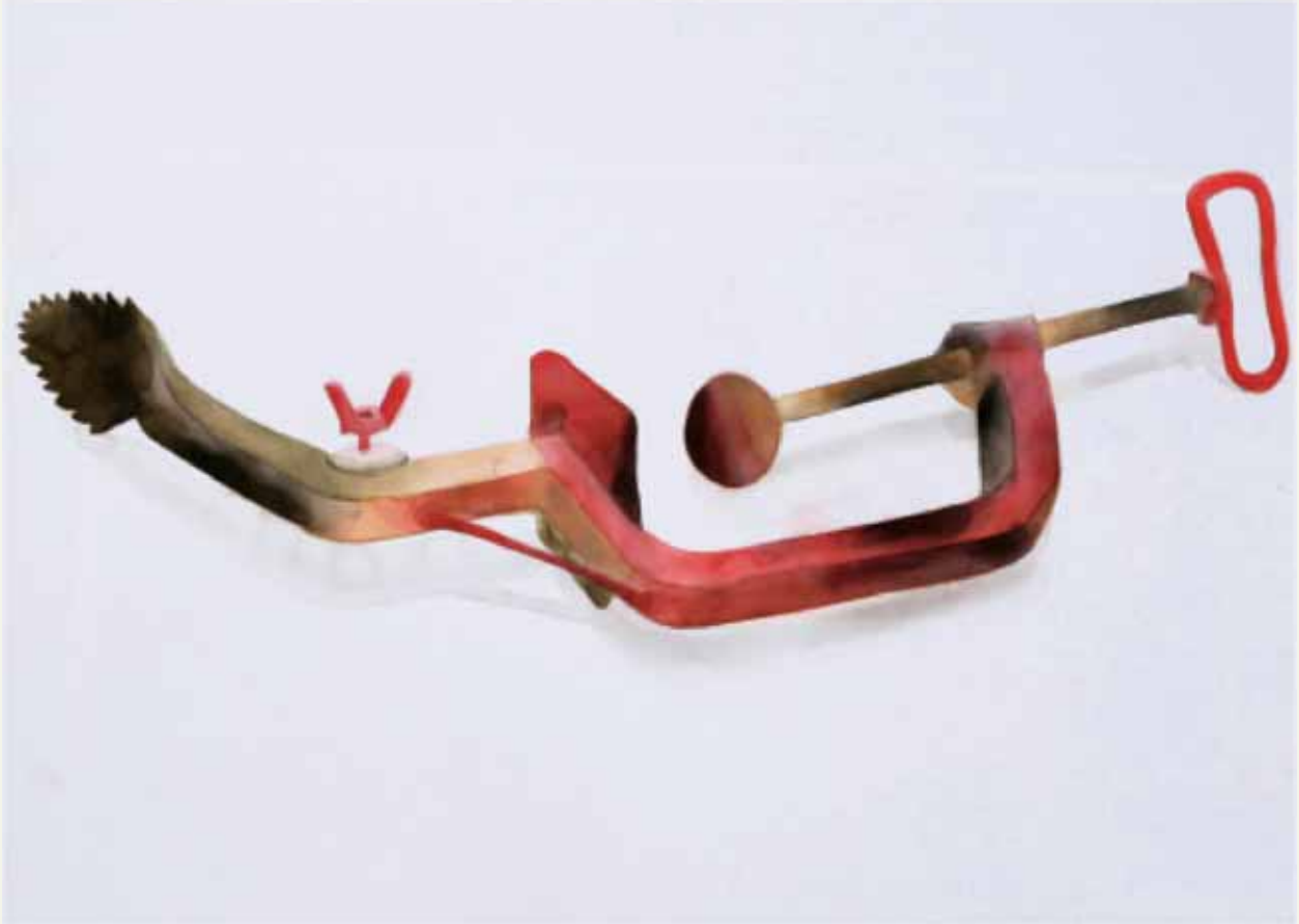
Untitled, 2007, Water colour on acid free paper, 32" x 43.5"