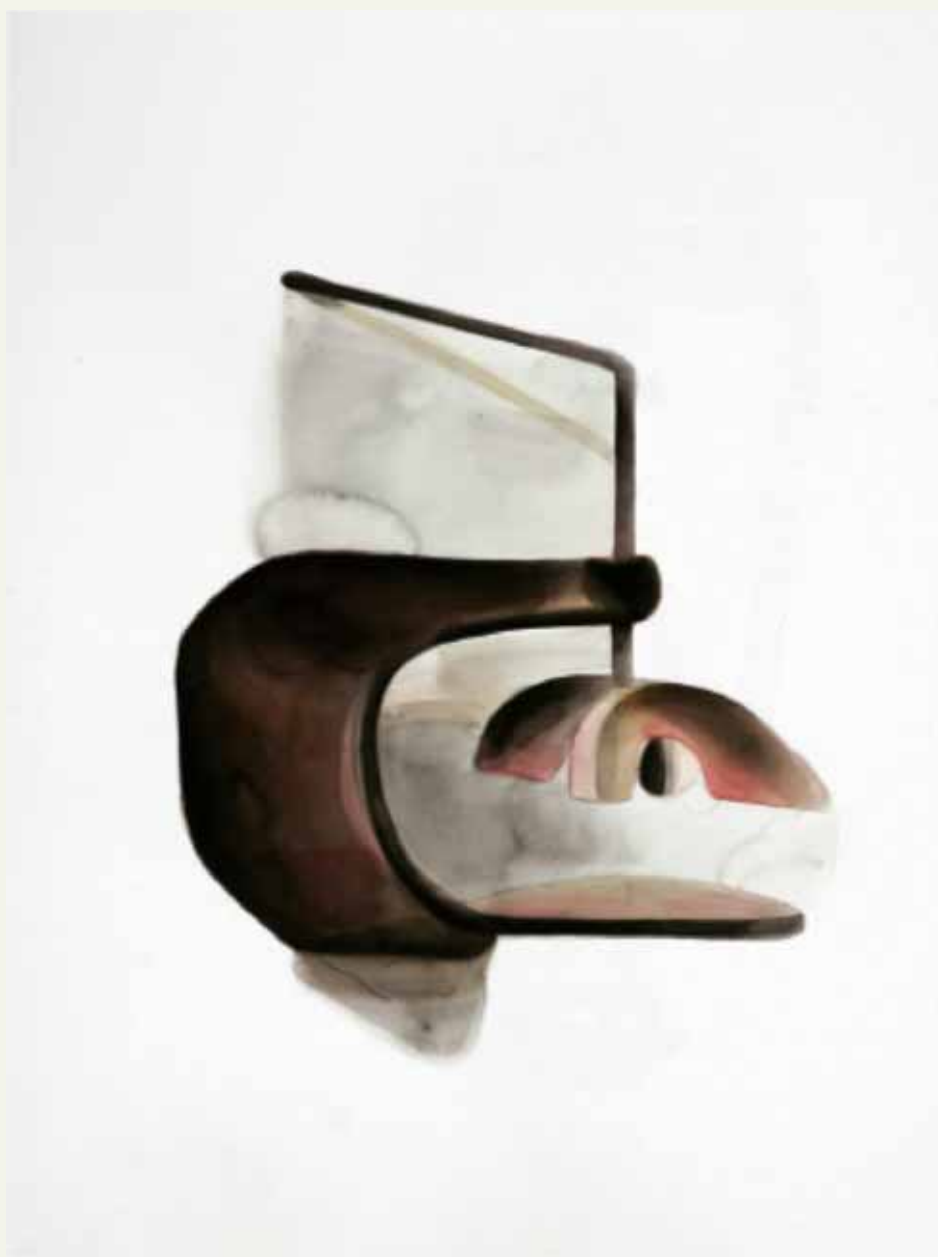
Untitled, 2007, Water colour on acid free paper, 43" x 33"