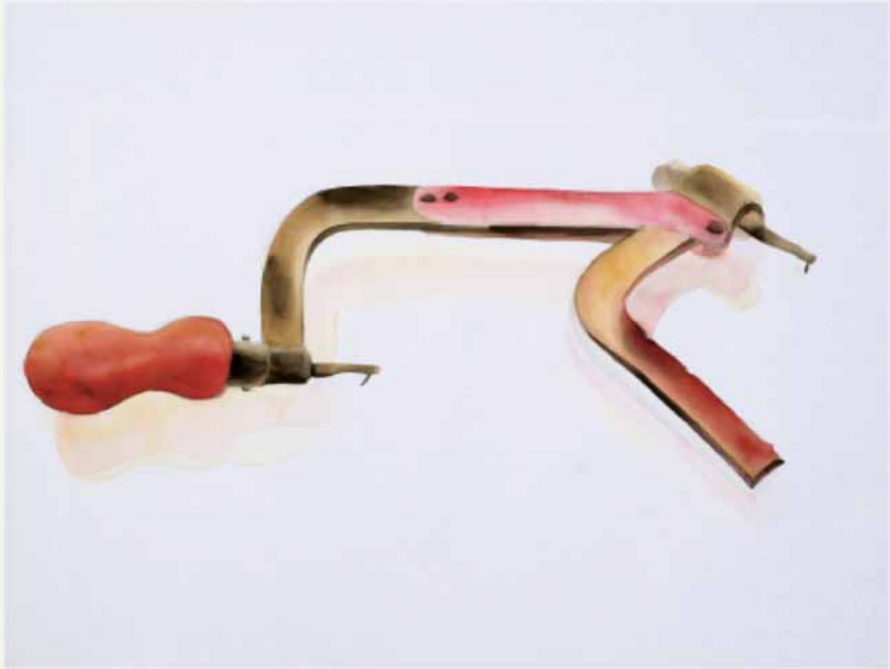
Untitled, 2007, Water colour on acid free paper, 33" x 43"