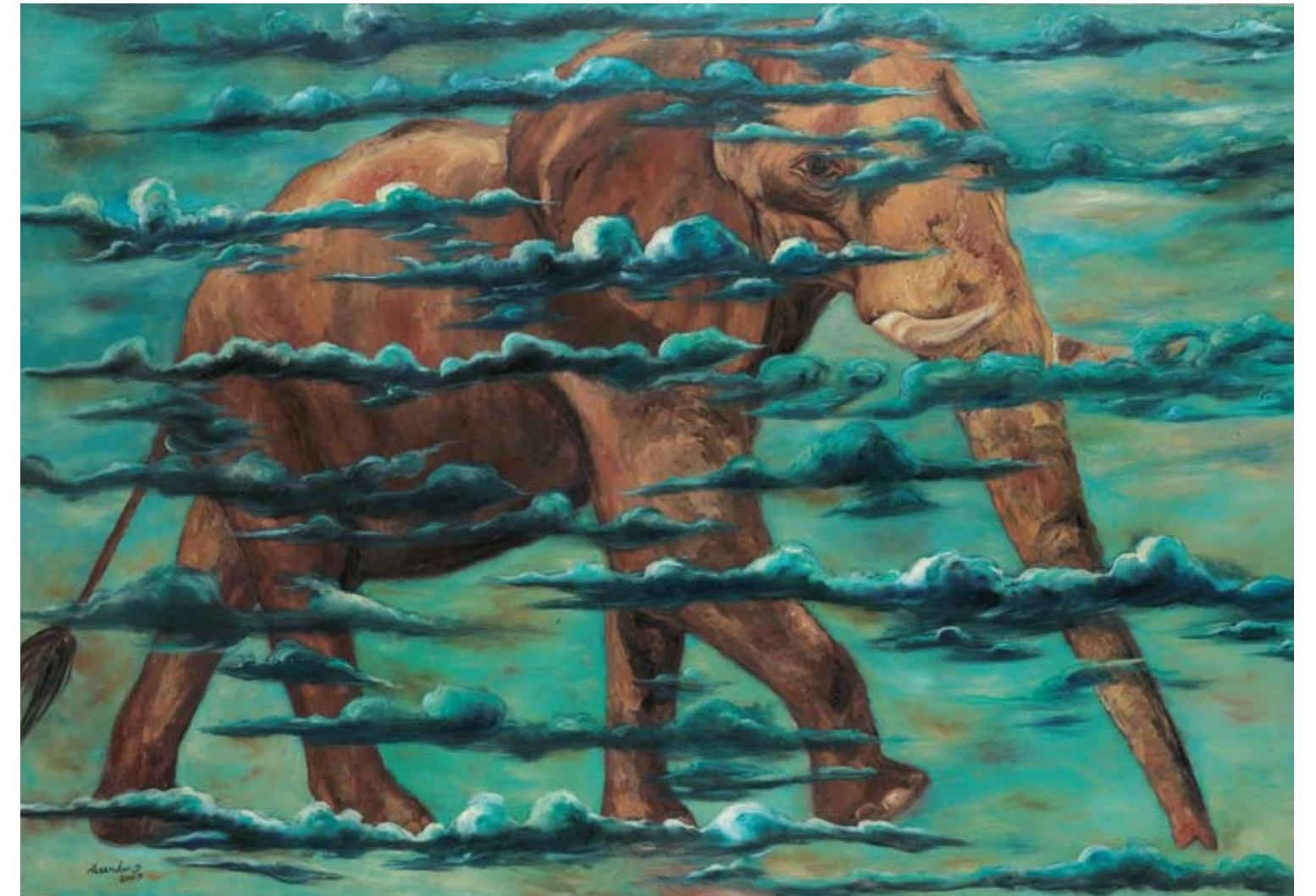
Elephant Oil on canvas (55 x 78 inch) 139 x 199 cm 2007

Once, during a troubled time of severe illness, I dreamt of an elephant sleeping beside our bed – not on my side, but on my Indian husband's side! It was a very consoling and happy moment.