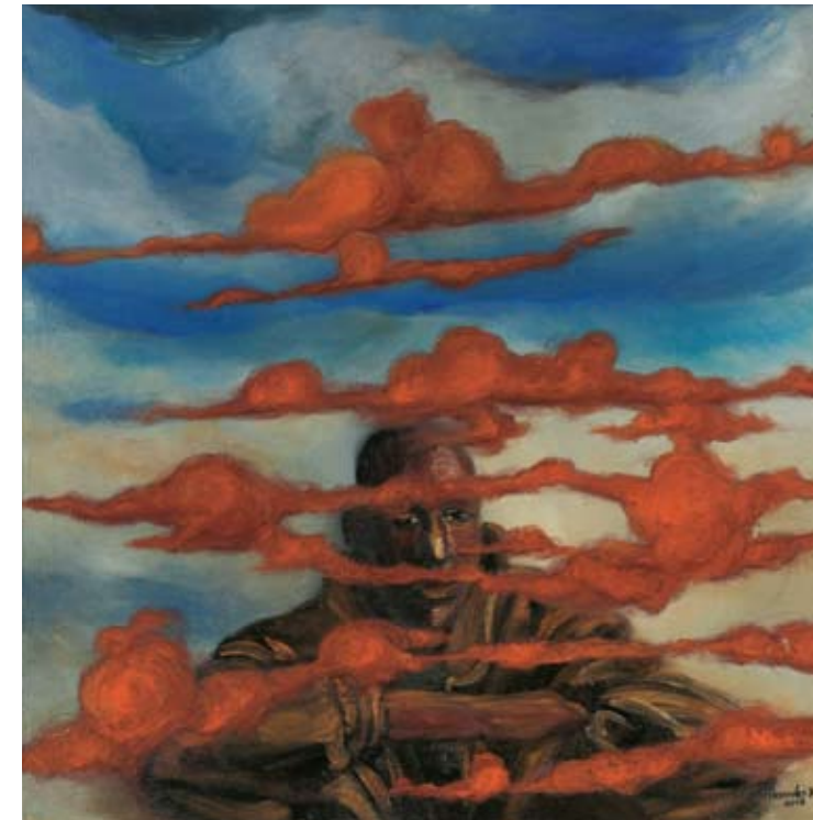
Commercial refugee Oil on canvas (31 x 31 inch) 80.5 x 80 cm 2006

Meanwhile, some women in Africa have started campaigns against the men to prevent them from leaving their society. There is no woman who doesn't miss her husband, brother, father or son. With all their energy, these women try to find new ways to make their male family members stay at home and find a livelihood in their homeland. But the young men are consistent in their desire to leave. As many times as they fail and are sent back to Africa, just as many times they try again. Their dreams will never end until they have reached "the other bank of the river".