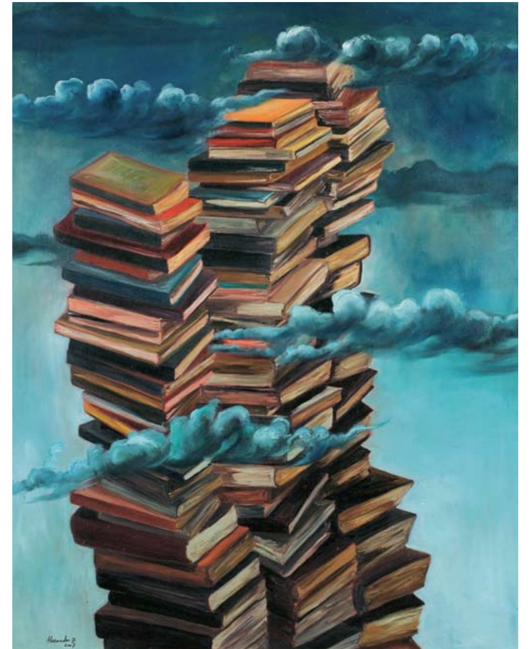
Alchemy Oil on canvas (60 x 48 inch) 152 x 121 cm 2007

Forbidden, banned and burnt books are not only a part of German history. Such methods to destroy knowledge, wisdom, passion, love, and freedom were carried out by certain people in cultures. The reason was to attain power over others by suppressing diversity. No doubt there must be energy in the books, fed by elements of eternal quality, lasting longer than a human life. Even though some books were once forbidden, banned, or burnt, and their secret readers punished, some books still remain. There are thousands of pages filled with words, expressions of ideas, stories, feelings, visions. When these are found and read, new life is given to these words from times passed, thereby opening a wider view of existence.