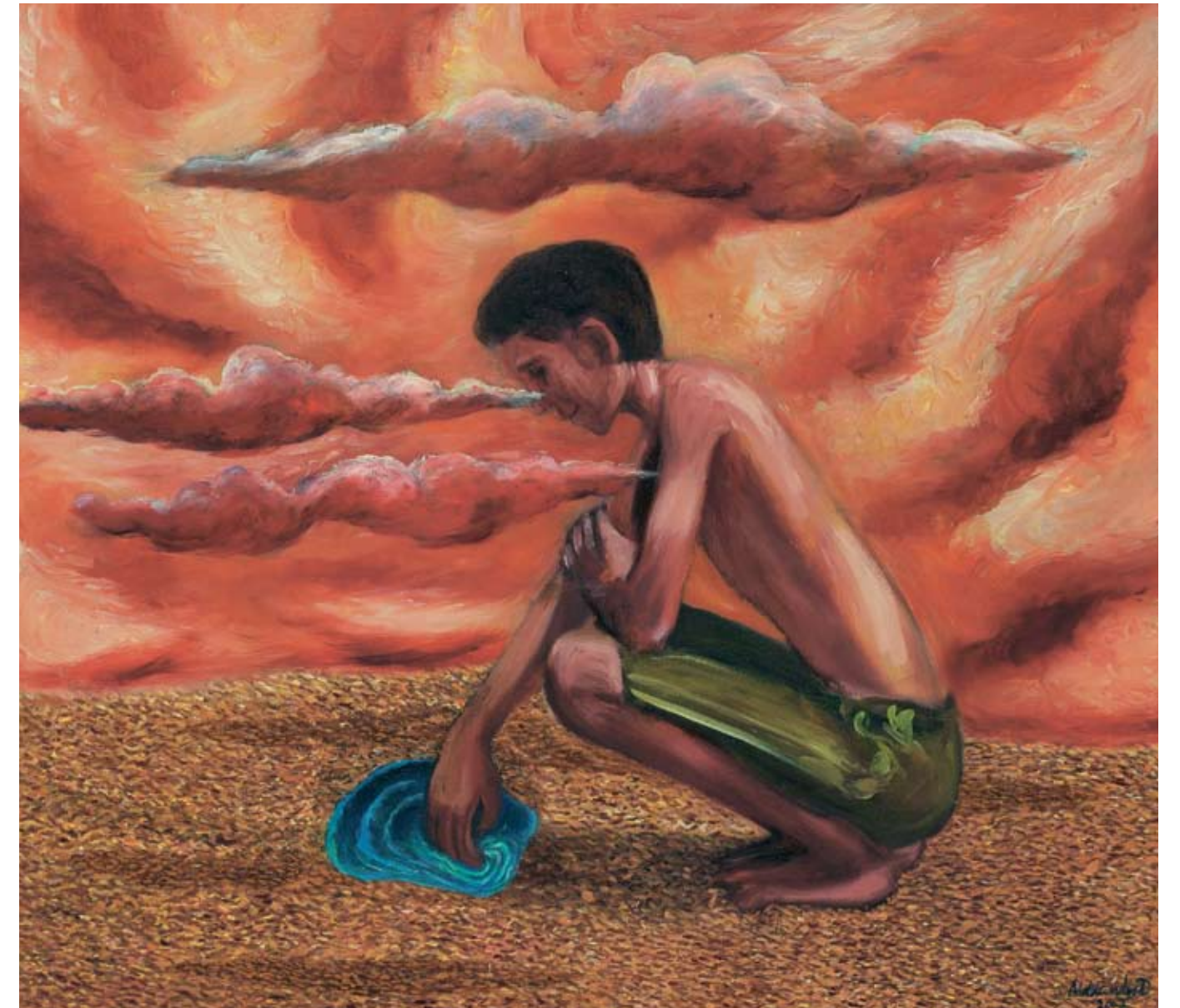
Boy sitting on the dried rice corn Oil on canvas ( 35 x 39 inch) 90 x 100 cm 2007

Here, in this painting, however, the boy is no longer motionless. Now he touches the water and appears as if something is about to happen!