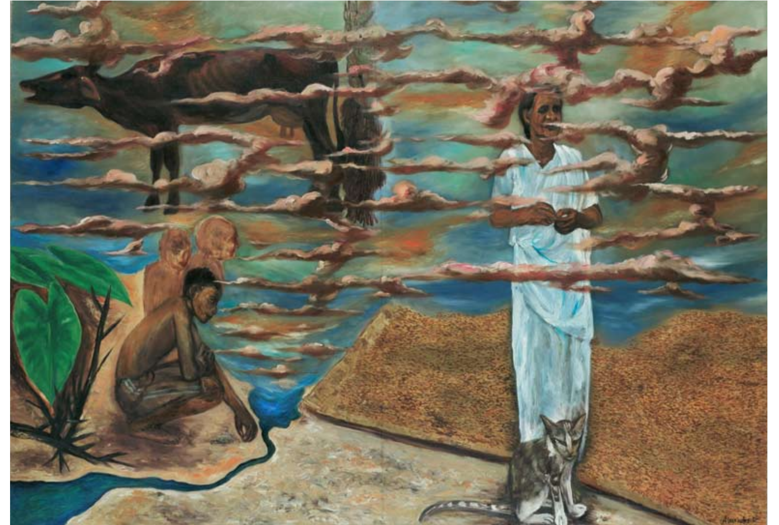
Tribute to my mother Oil on canvas (55 x 78 inch) 140 x 200 cm 2006

In his painting »Mother«, the artist brings two periods of his life together; namely the past and present. From the daily experiences of his childhood, sun-dried ricecorn meant food and life to him. As a little boy, he dreamt of the flow of a small canal leading up to the sky. The artist's mother with her cat, Lakshmi, is shown in the present time, old but still active. Throughout her life, she struggled and worried. Her memories range from the most painful to the happiest of days. She has given birth to eight children. Today, she has four great-grandchildren and still exists as the centre of the artist's large family. The skinny Indian cow in the clouds bridges the past and the present, which are two different and separate worlds. For the artist, imagination is very fragile and continues changing shape.