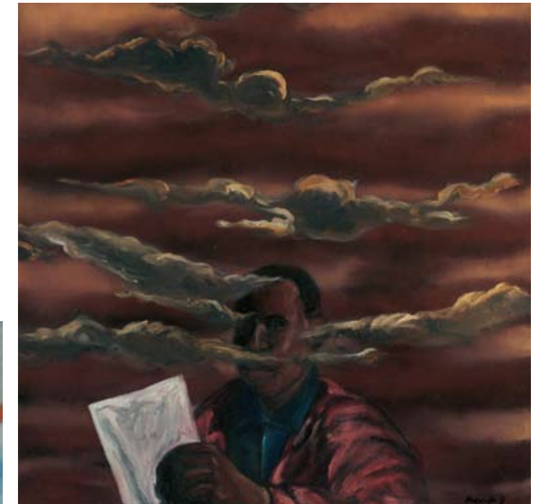
Political Refugee Oil on canvas (31 x 31 inch) 80.5 x 80.5 cm 2006