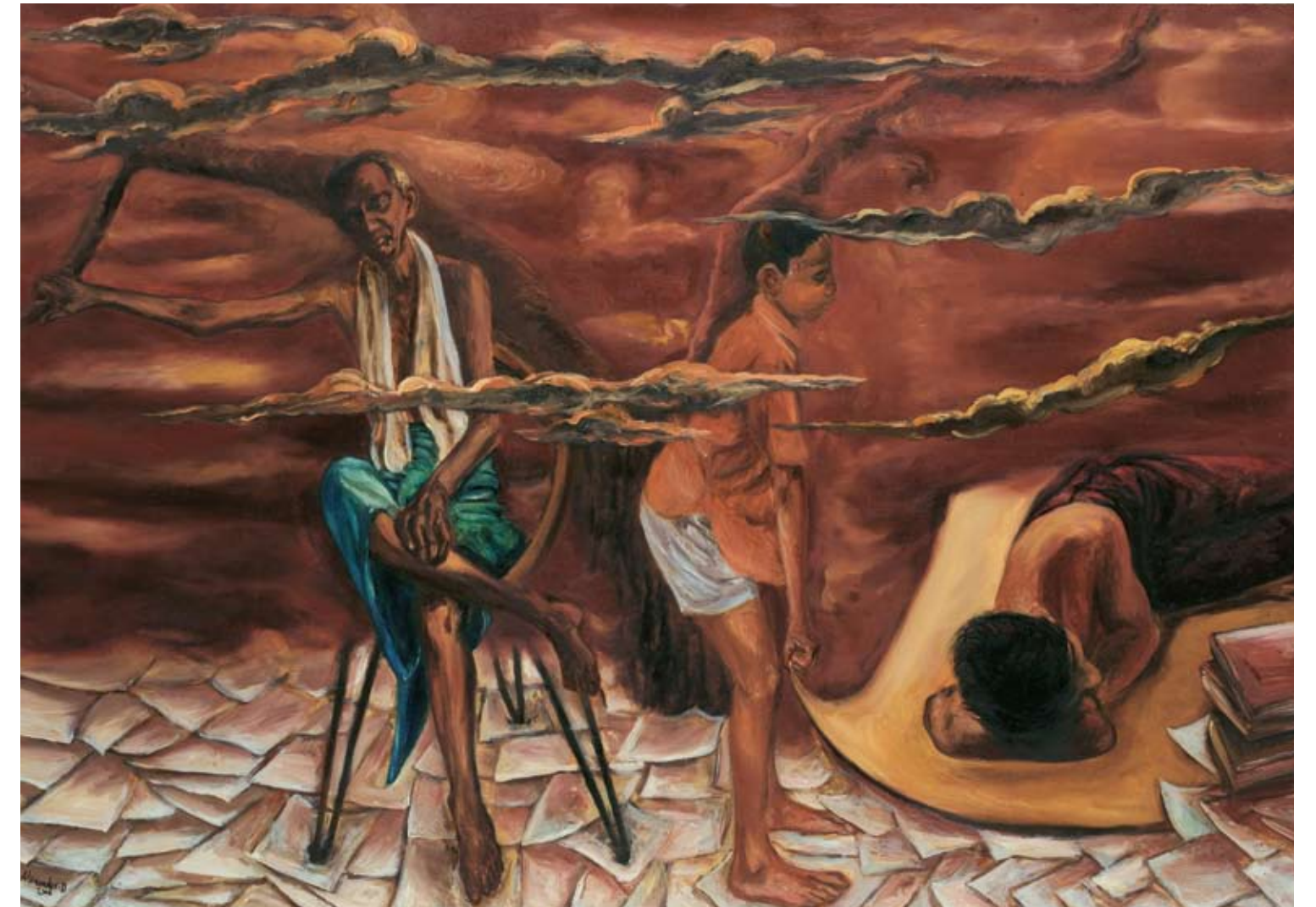
Tribute to my father oil on canvas Oil on canvas (47 x 67 inch) 120 x 170 cm 2006

The artist sees the Father living in a cocoon of solitude. While growing older, the Father has detached from his sense of physical space and does not long for it; instead he is seeking spiritual fulfillment. Everyday he walks barefoot to prayers. Could it be that this ever-changing life has exhausted him from following (his own path)? For him, modern life seems non-sensical. Now, during this time of globalisation, there is no space for him. Once he was a freedom fighter, imprisoned and tortured, but now he is a 90-year old stranger in a world where his time had come and gone too long ago.