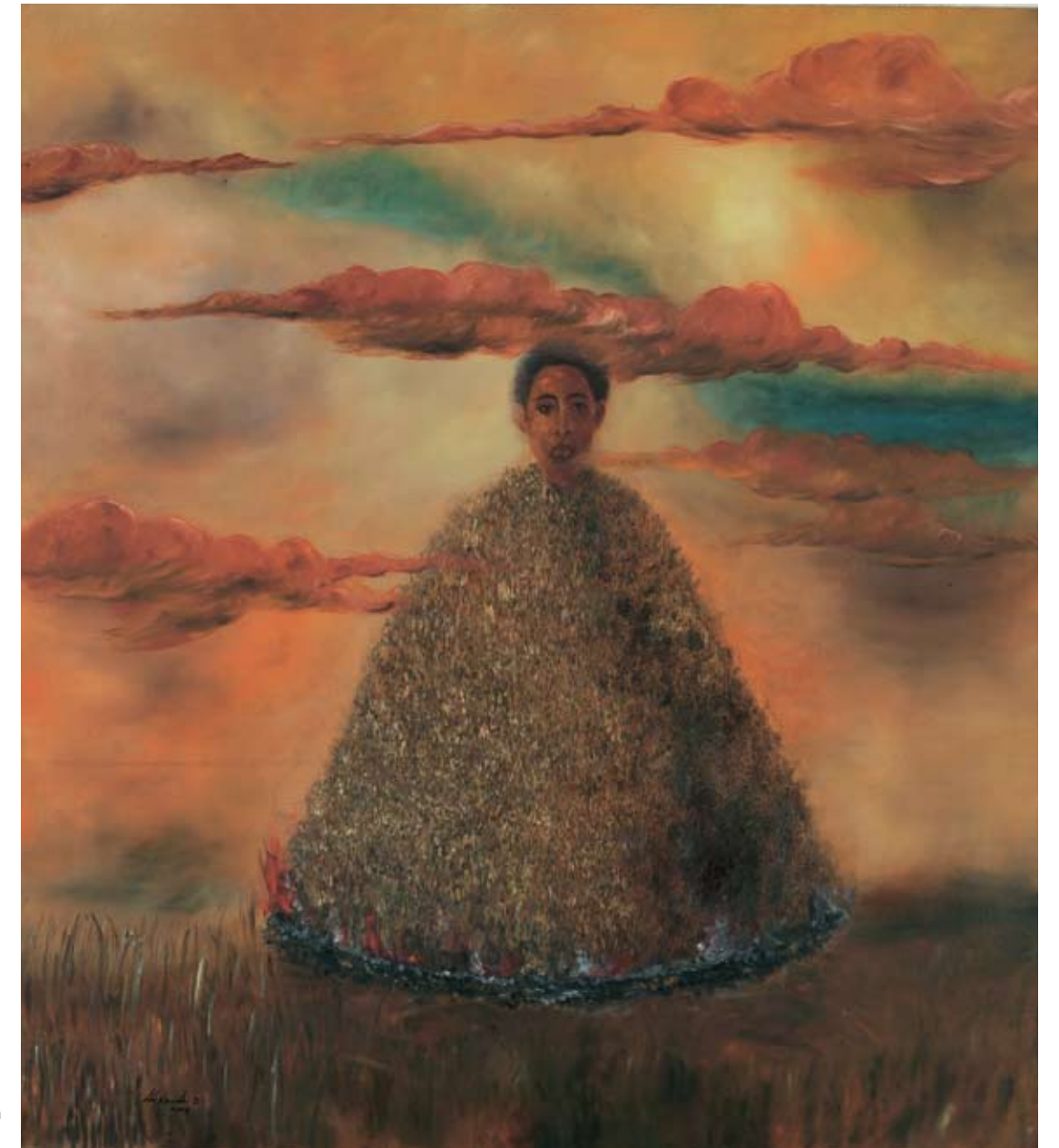
The portrait of a poet on his last day Oil on canvas (53 x 47 inch) 134 x 120 cm 2006