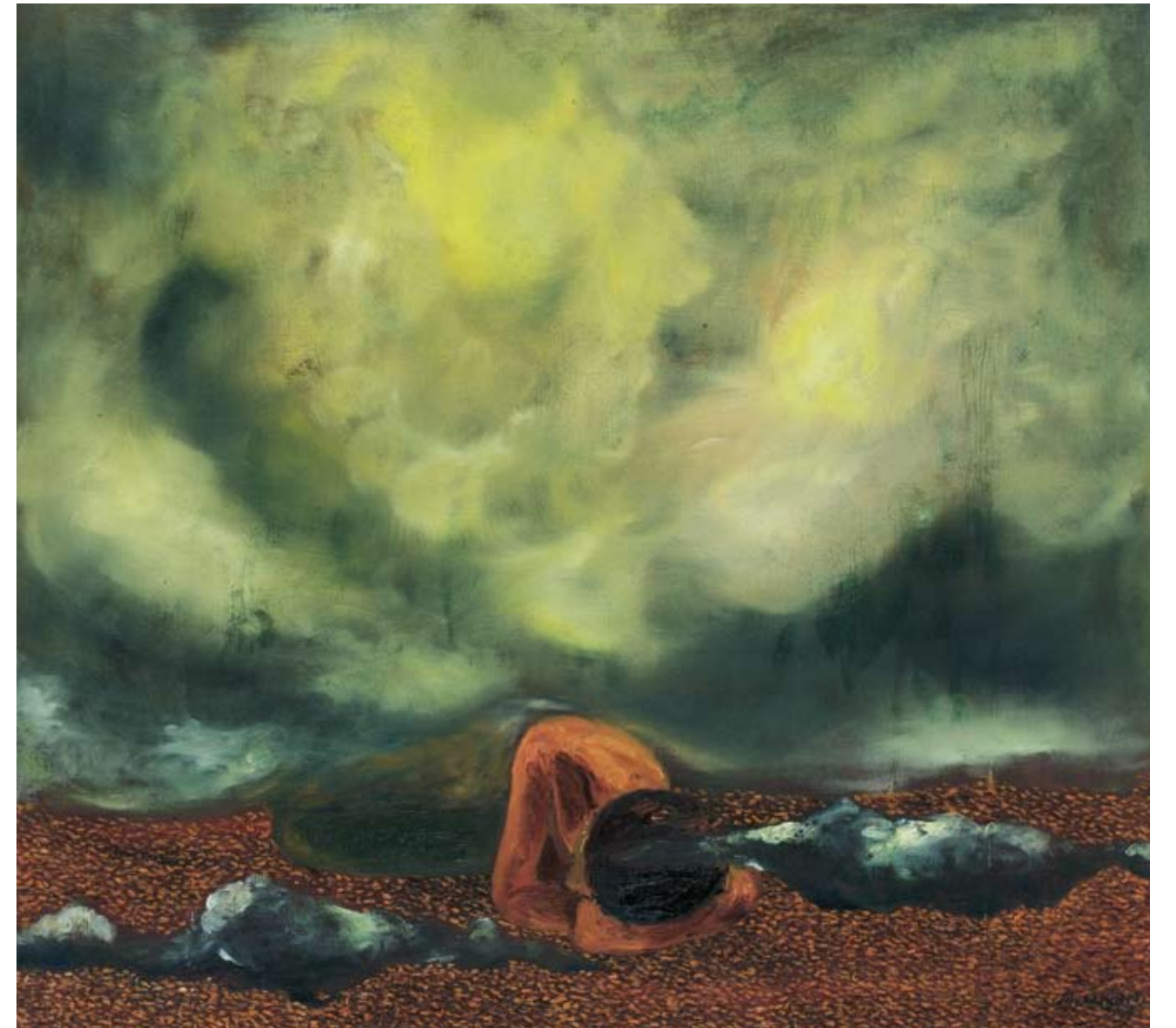
Boy sleeping on dried rice corn Oil on canvas (31.5 x 35 inch) 80 x 90 cm 2007

The sky is a kind of visible eternity. Long before humans existed, the sky was there, and it will remain even after humans cease to exist.